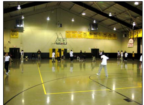
Appling Middle Gymnasium