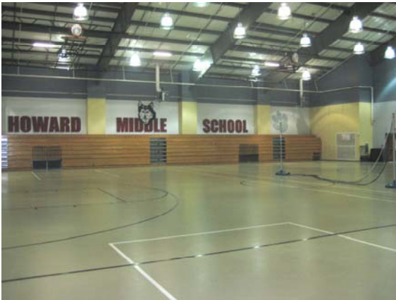
Howard Middle Gymnasium