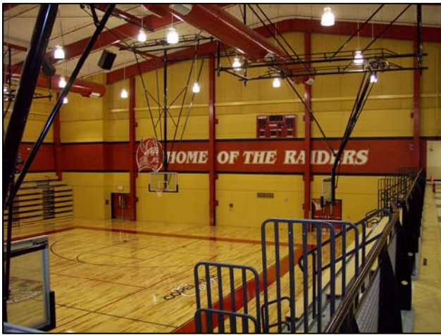
Northeast High School's Mark Smith Gymnasium