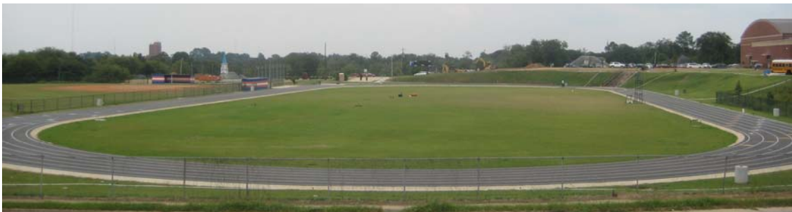
Central High Track