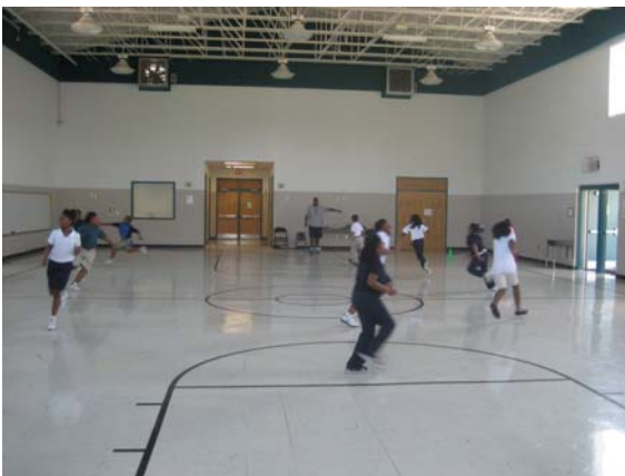
Lane Elementary Gymnasium