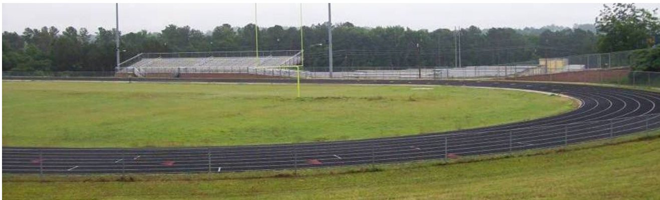
Thompson Stadium Track