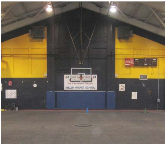
Miller Middle's Gymnasium