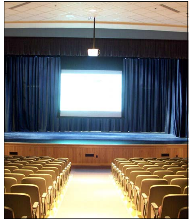
Howard High Auditorium