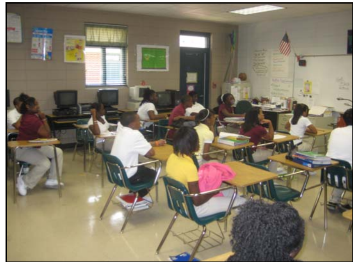
Weaver Middle Classroom Addition